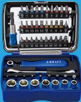
Item no. 932050