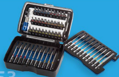
Item no. 93B053